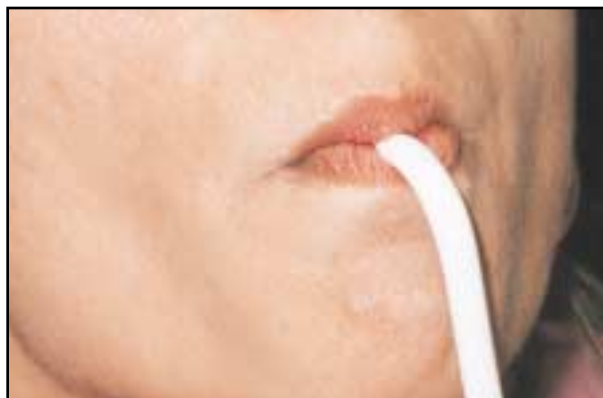
Figure 1. Some clinicians instruct their patients to close their lips around the suction tube. This could pull microorganisms back through the tube.

The solution: Many have added the “oral cup” with a paper lining that attaches to the high-speed suction. Others have gone to the old standby of “just close your lips around the straw” (Figure 1). I would like to examine the question of “to suck or not to suck” when utilizing a slow-speed suction tip for fluid evacuation.