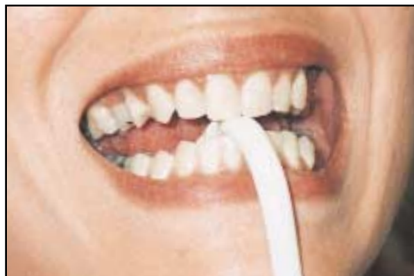
Figure 2. The potential for microorganisms to be pulled back up through the tube into the mouth is decreased if patients close only their teeth around the suction tube.

I cringe when my children’s hygienist and many of my colleagues ask their patients to “suck on Mr. Thirsty.” I had read many years ago that there was a potential for microorganisms to be pulled back up through the tube into the mouth when a seal was formed around the suction tip. Infection control guidelines now tell us to flush each unit every morning, following each patient, as well as replacing the filters routinely. But how many of us do that? Research has been conducted here in the United States as well as in Canada beginning in 1993. It has been documented that trace amounts of biofilm are being pulled back into the tip and potentially into the mouth. The American Dental Association has made a statement regarding saliva ejectors, which can be found on its website dated September 8, 1999 ( http://www.ada.org/prac/position/ejectors.html ). It states that there are no adverse health effects from sucking on the tip, but it recommends asking the patient not to close his or her lips around the tip during the procedure.